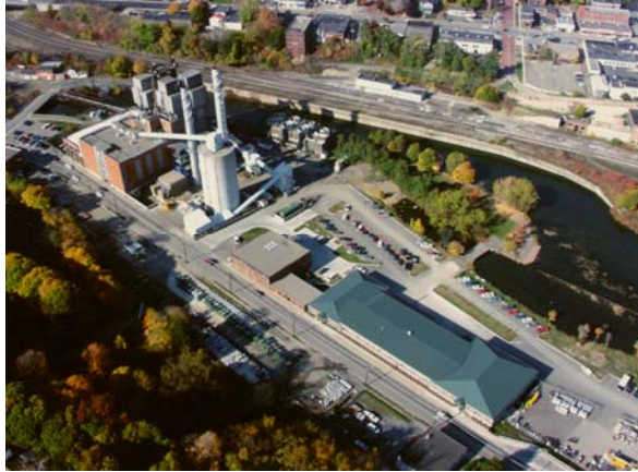
The Samuel Carlson Electric Generating Station (136 Steele Street) and the BPU Operations Center (92 Steele Street, Jamestown, NY)

This handbook is designed to introduce you to the City of Jamestown Board of Public Utilities and provide information concerning the BPU's many services. It contains several important telephone numbers, as well as critically important advice for various situations. Please keep this booklet handy so that you may use it for future reference. The Jamestown BPU wishes to thank its customers for their many years of support and promises many more years of quality service to the residents of the City of Jamestown and the surrounding communities.